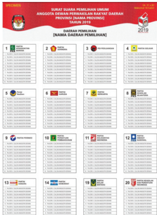
Figure 3: 2019 provincial legislative election ballot paper

The literature on political sophistication shows that voters have different levels of understanding political information. There are fewer voters with political sophistication than those without. Regarding elections, voter confusion in digesting information on candidates and political parties is a democratic problem that should be corrected. 23 Voter confusion due to ballot paper design is a significant concern and note for the implementation of elections in Indonesia because of three things: 1) the presidential election confiscates almost all election topics national elections, 2) the design of the legislative election ballot paper does not include photos and consists of successive names making voters with good political